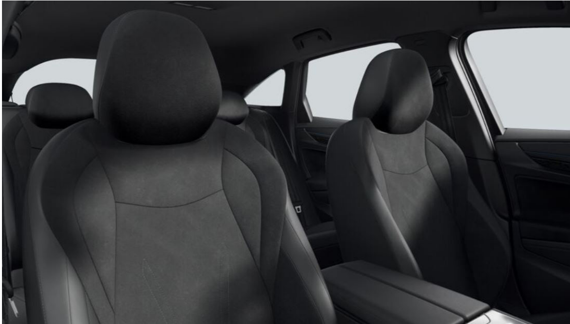
Inserts of front seats and outer rear seats in ArtVelours ECO microfleece, seat bolsters in Artex Soul Black (ZN) Standard from ID.7 PRO PLUS