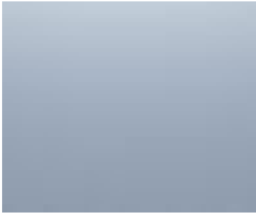
Stonewashed Blue Metallic 5Y5Y