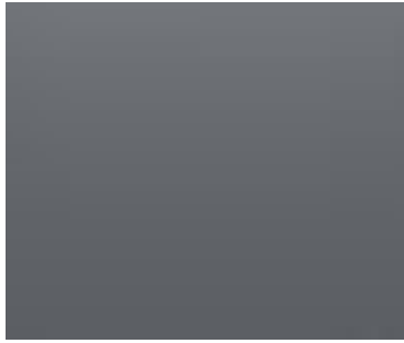
Moonstone Gray C2C2