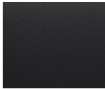
Grenadilla Black Metallic 0E0E