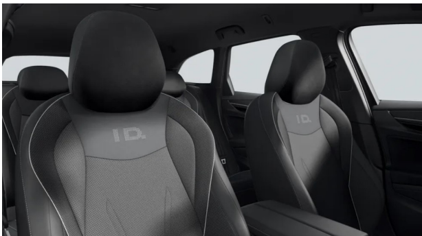
Inserts of front seats and outer rear seats in perforated ArtVelours ECO microfleece, seat bolsters in Artex Soul Black (ZO) Optional from ID.7 PRO PLUS (forces option package PBF)